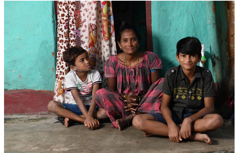
The name and photo have been used for representational purposes only, to protect the identity of the children and family.