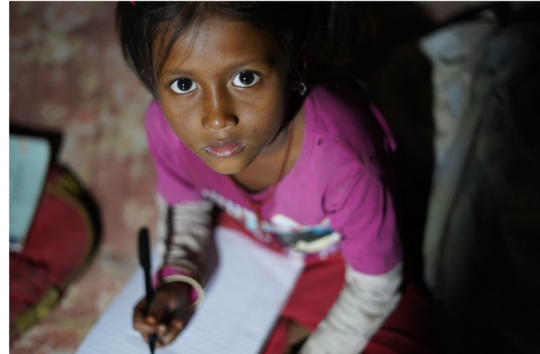
The name and photo have been used for representational purposes only, to protect the identity of the child.