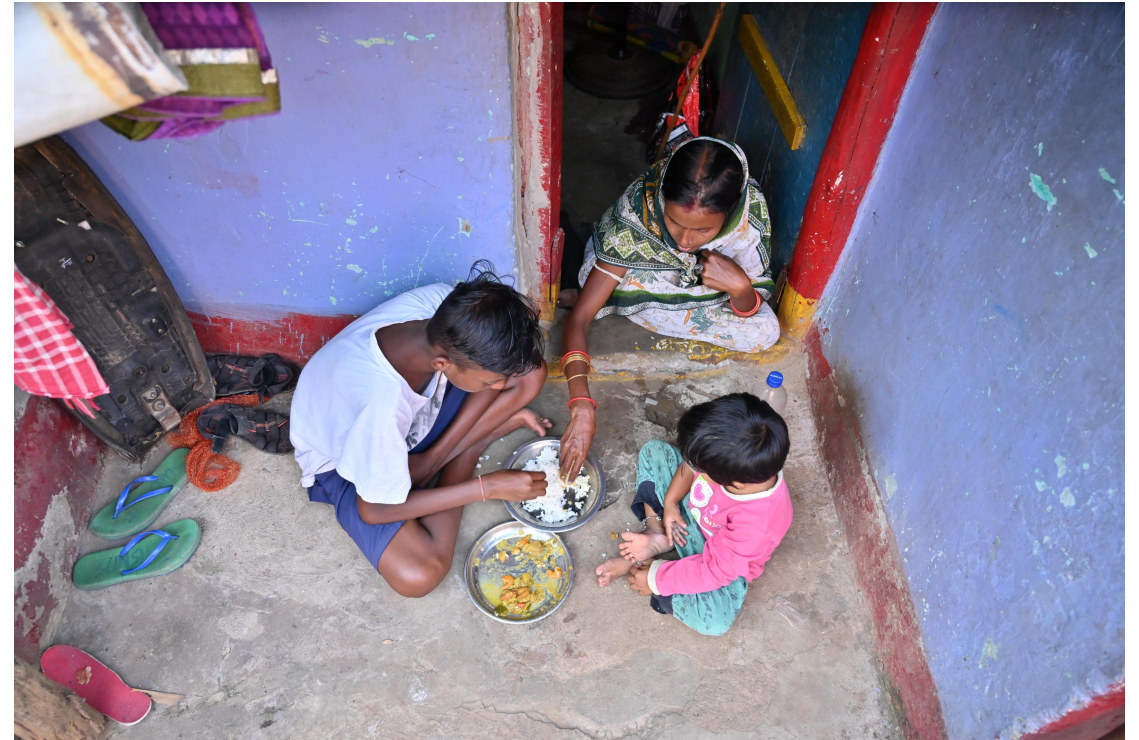
The name and photo have been used for representational purposes only, to protect the identity of the child.