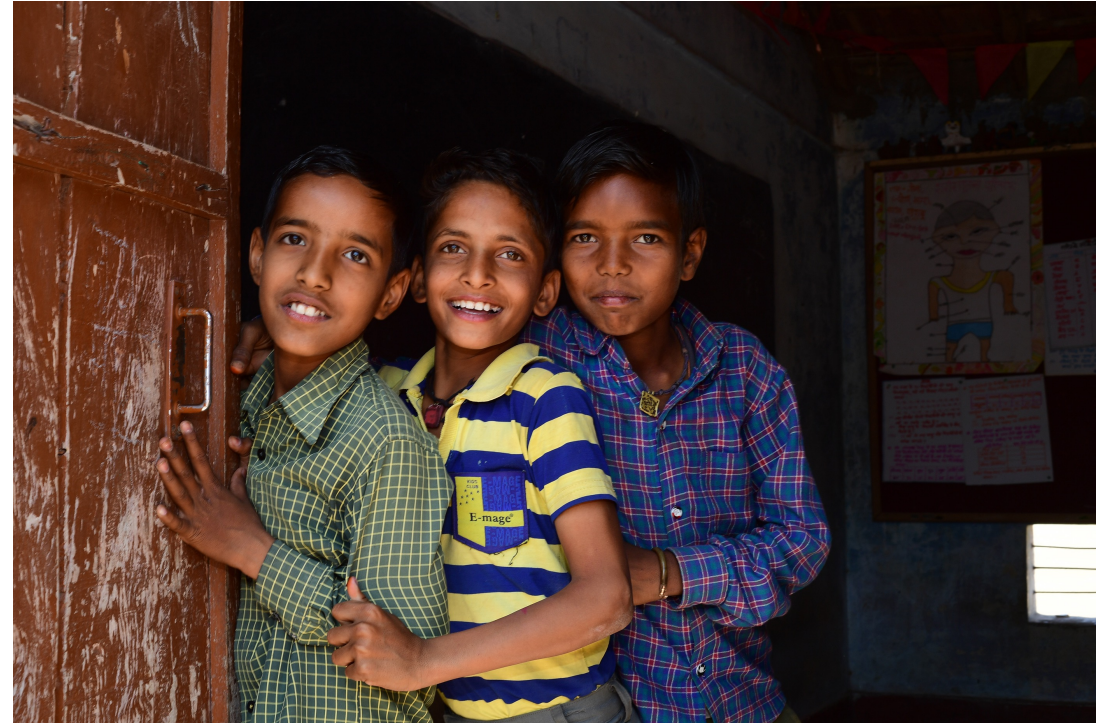
The name and photo have been used for representational purposes only, to protect the identity of the child.

Aayan has set an example for the other adolescent boys in the community and a close follow up is being kept ensuring that there is no disruption in Aayan's studies and also for his siblings, who should not become victims of any forms of abuse.